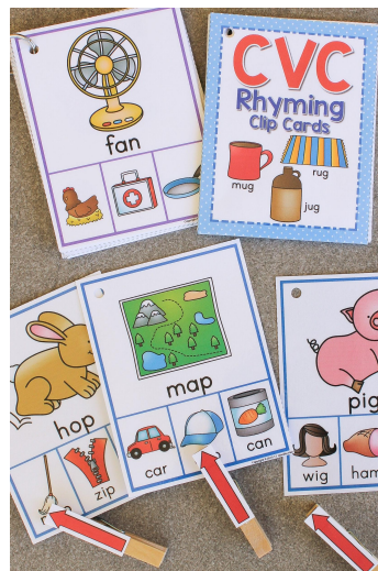
Rhyming Clip Card Activity