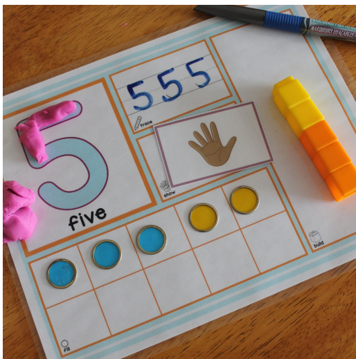
1-20 Number Activity Mats

I think that you will also like the activities pictured here. Click on the photos to learn more about the resources.